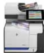
color MFP M575dn