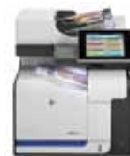
color MFP M575f