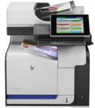
(HP LaserJet Enterprise 500 color flow MFP M575c)