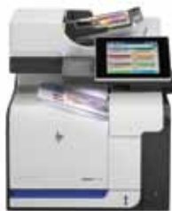
(HP LaserJet Enterprise 500 color MFP M575f)