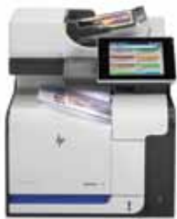
(HP LaserJet Enterprise 500 color MFP M575dn)