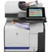
color flow MFP M575c